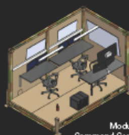
Modular Command Centre