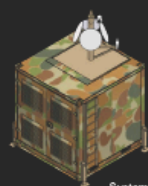
Deployable Systems Enclosure